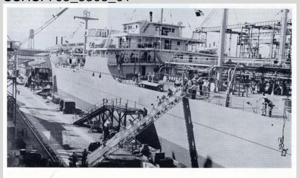
3.5: Ship being delivered to Sun Oil Co.On June, 30, 1953500_589_005

3.4: Ship at 2 Pier with 'open house' with guests from Washington. c: June, 1953 705_5308_01