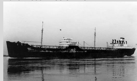
6.4: Photo of her as the 'Paul H. Carnahan'.