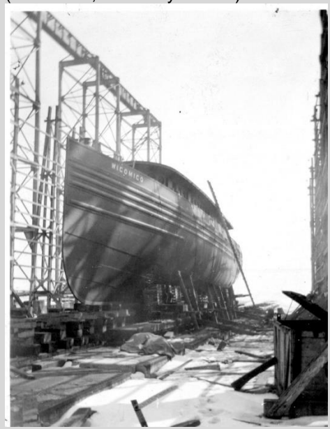
4.3: 454_88_2609_674ra, C: 1926.02

4.2: view of towboat on No.8 Shipway C: 1926.02 (SS-P-027)