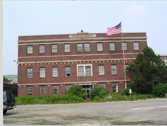
4.6 Sadly, one of the 877 photos taken during the 'demo' of the 'Main Office', which show great detail of the construction of the 'Main Office'